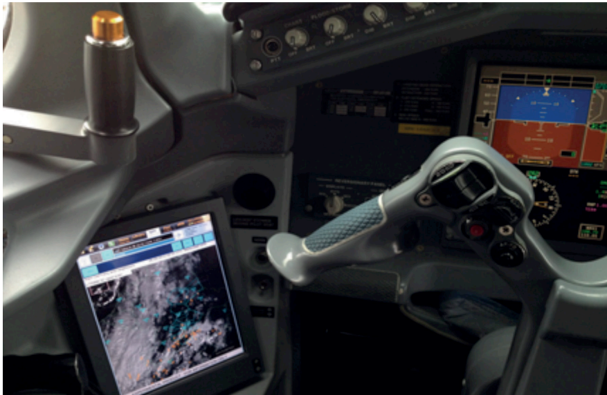
ELECTRONIC SUPPORT THROUGHOUT THE FLIGHT Cb-TRAM on a Lufthansa EFB in the cockpit.

Ritter explains, “Overlooking a gap between cells—what happened to us—probably happens somewhere each and every day. One of the real benefits of Cb-TRAM is that it enables us to better detect such gaps. It can even prevent us from flying into thunderstorm ‘cul-de-sacs’ from which there’s no way out. The benefits of this technology are clear: With the full cloud top view—information that the radar doesn’t provide—and short-term thunderstorm information, the system enables us to avoid lightning and icing and gives us increased safety. And at Lufthansa, safety is by far what’s most important to us. The system also allows for a more comfortable flight since it helps us to circumnavigate turbulent areas. And it saves fuel, too, by showing us more effective routes.” Captain Ritter’s conclusion? While on the whole, there may not be a huge number of flights where the benefits of the system fully come to bear, for those flights where it can make a real difference, “it’s a great addition to the radar and an impressive product—I’m excited about it.”